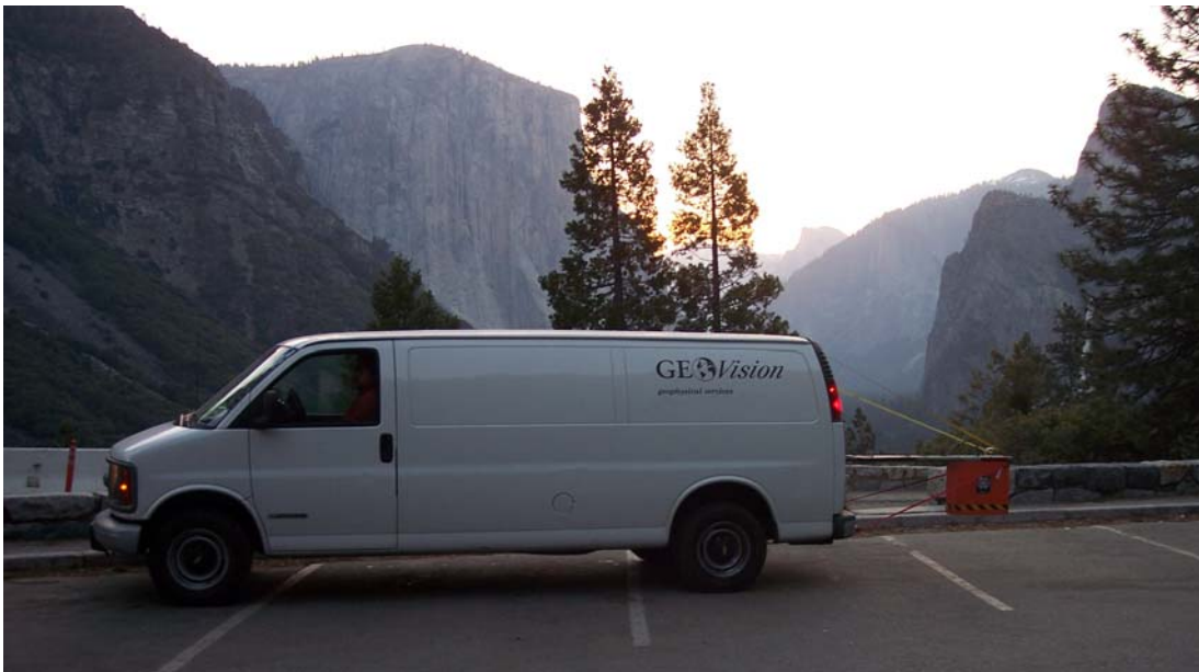
GPR Investigation at Yosemite National Park, California