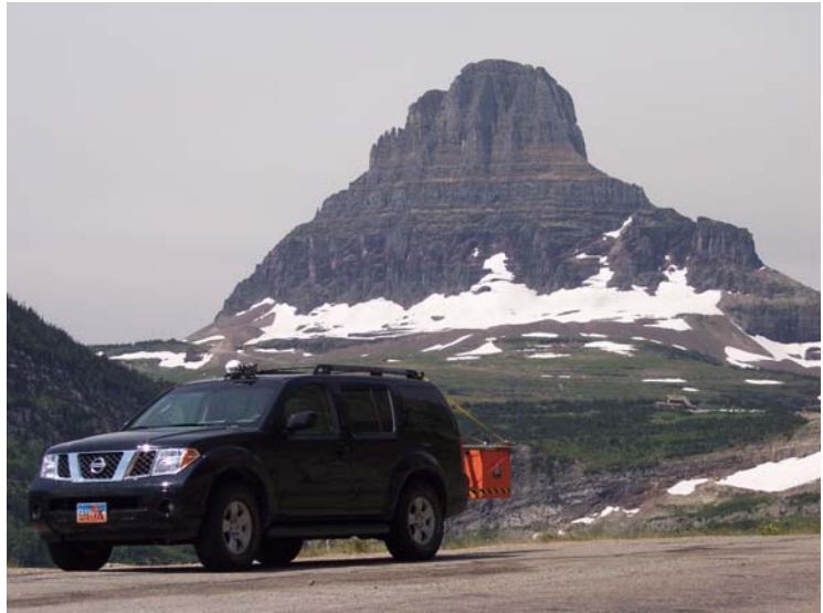
1.0 GHz air-coupled antenna on high-speed pavement survey Going to the Sun Highway – Glacier National Park, Montana

GEOVision uses the best available GPR equipment for highway applications—a GSSI SIR-20 system (or the older GSSI SIR-10B) with one or two 1.0 GHz Model 4108 antennas. Being the first and second fastest data acquisition systems available, respectively, they survey at higher speeds than any other GPR instruments.