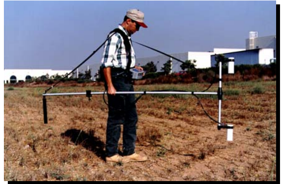
Geometrics G-858 Magnetometer

Anomalies in the earth's magnetic field are caused by induced or remanent magnetism. Induced magnetic anomalies are the result of secondary magnetization induced in a ferrous body by the earth's magnetic field. The shape, dimensions, and amplitude of an induced magnetic anomaly is a function of the orientation, geometry, size, depth, and magnetic susceptibility of the body as well as the intensity and inclination of the earth's magnetic field in the survey area. Buried ferrous metallic objects, such as pipes, drums, tanks, and debris generally give rise to dipolar anomalies with a positive response south and a negative response north of the object. The magnetic method is an effective way to search for small metallic objects because magnetic anomalies have spatial dimensions much larger than those of the objects. An oil well typically gives rise to a monopolar anomaly with a very high amplitude, positive peak several feet south of the well and a low amplitude, broad negative response to the north. The magnetic anomaly over a buried oil well often has a diameter of over 50 feet and amplitude of several thousand nanoteslas, depending on depth and casing characteristics. Magnetometers can typically locate an abandoned oil well to depths of over 20 feet providing that background noise levels are not too high and the well casing is not significantly corroded. Magnetometers are not able to detect nonferrous metals such as aluminum and brass.